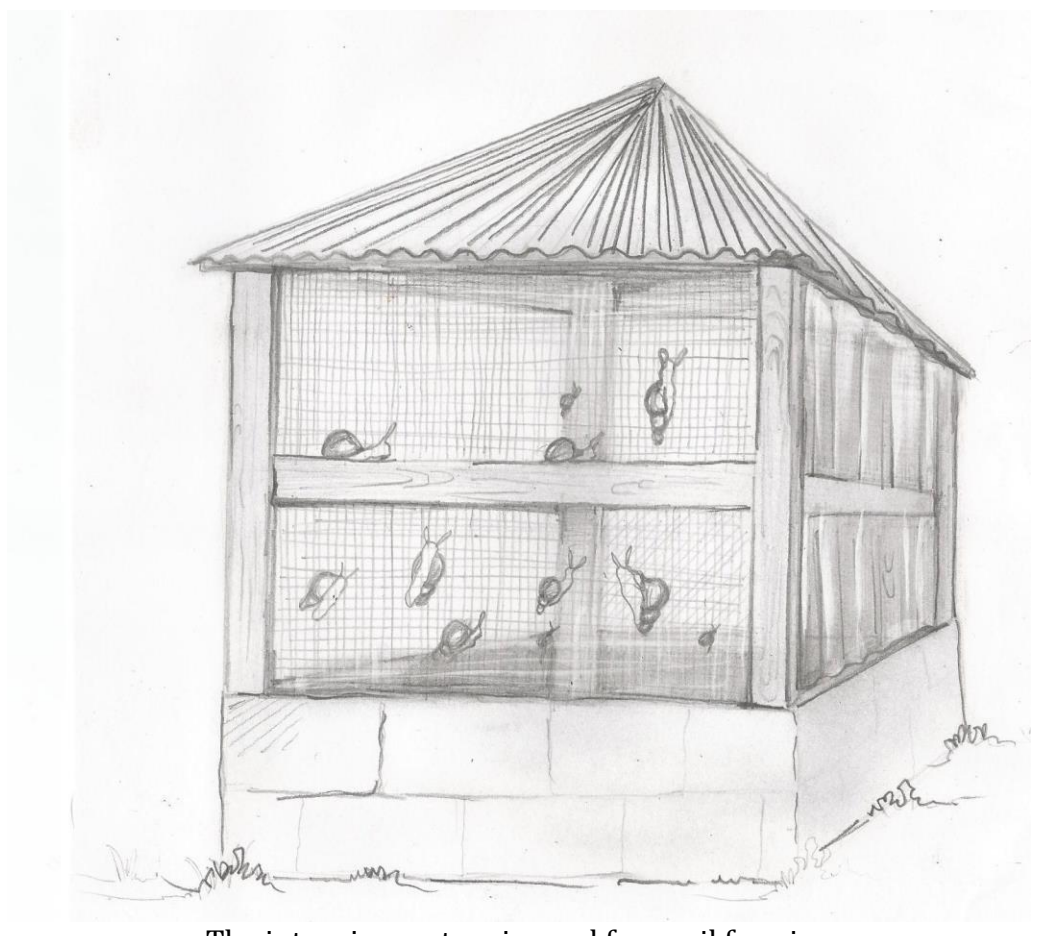
The intensive system is good for snail farming

Housing: Use intensive system of rearing. It can be high or low fenced pen, tank pens, baskets, drums, trampolines. In the construction of high fenced pen the walls should be a dwarf wall with bricks 1m high built all around it and with wire gauze at the top. Dig a trench all-round the bottom of the fence and pour used engine oil to protect it from intruding insects. The same technique is used in low fenced pen. One can as well rear snails in his/her farm, it involves planting or bringing in snails loving plants such as plantain, banana, pawpaw and cocoyam. After attracting them you fence the farm dig trench round the bottom and pour engine oil in it to avoid intruding ants.